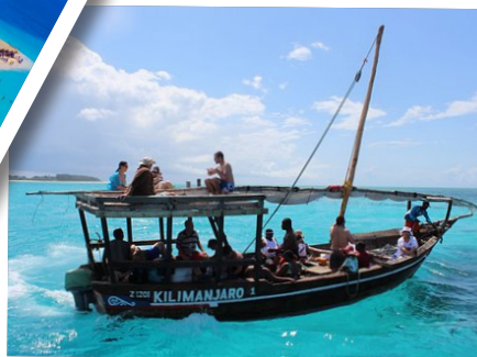
Safari Blue Tour Day 3 | HALF BOARD MEALS