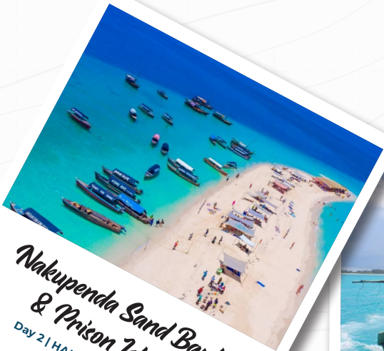
Nakupenda Sand Bank & Prison Island Day 2 | HALF BOARD MEALS