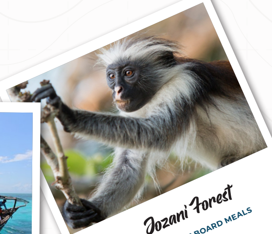
Jozani Forest Day 4 | HALF BOARD MEALS