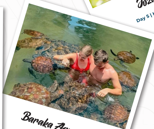
Baraka Aquarium Day 4 | HALF BOARD MEALS