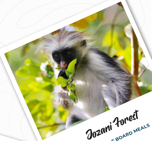
Jozani Forest Day 5 | HALF BOARD MEALS