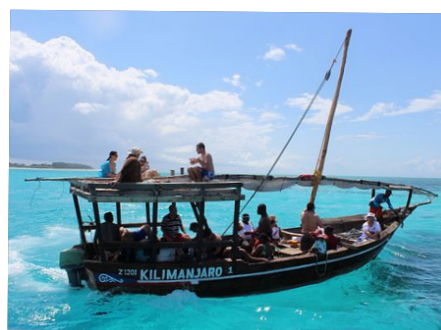
Safari Blue Tour Day 3 | HALF BOARD MEALS