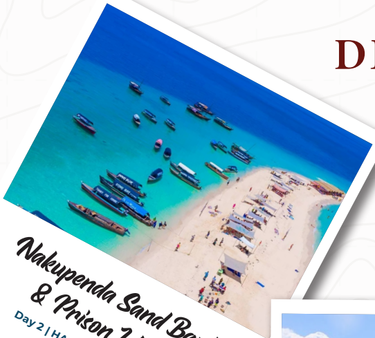
Nakupenda Sand Bank & Prison Island Day 2 | HALF BOARD MEALS