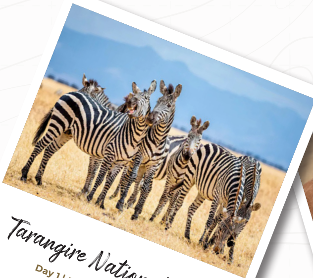
Tarangire National Park Day 1 | FULL BOARD MEALS