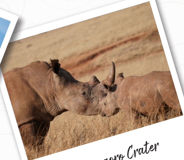
Ngorongoro Crater Day 2 | FULL BOARD MEALS