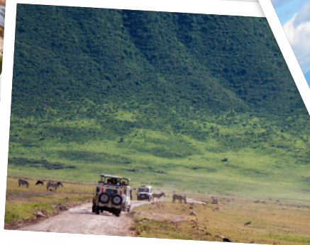
Ngorongoro Crater Day 3 | FULL BOARD MEALS