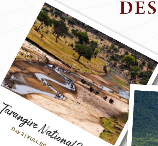
Tarangire National Park Day 2 | FULL BOARD MEALS