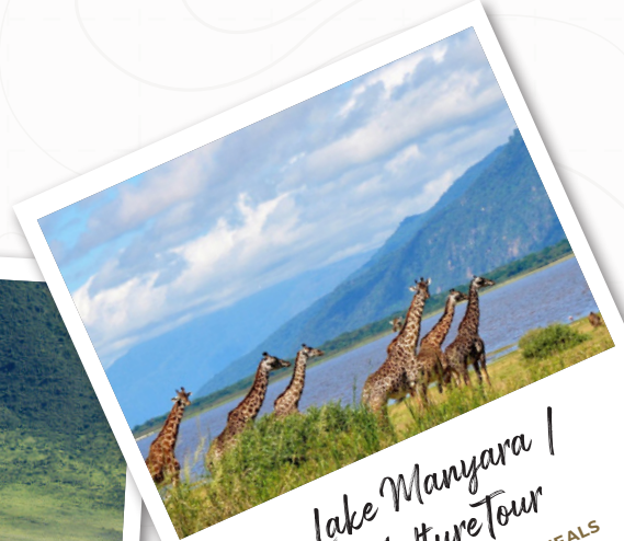
Lake Manyara / Culture Tour Day 4 | FULL BOARD MEALS