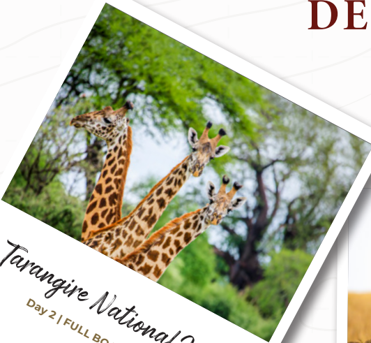
Tarangire National Park Day 2 | FULL BOARD MEALS