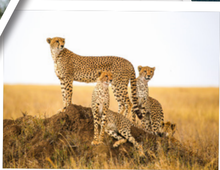
Serengeti National Park