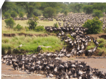
Serengeti National Park Day 3 - 4 | FULL BOARD MEALS