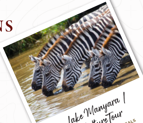
Lake Manyara / Culture Tour Day 6 | FULL BOARD MEALS