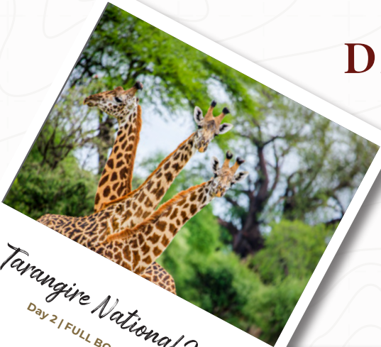
Tarangire National Park Day 2 | FULL BOARD MEALS