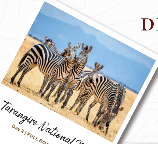
Tarangire National Park Day 2 | FULL BOARD MEALS