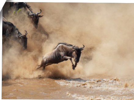
Serengeti National Park Day 3 - 5 | FULL BOARD MEALS