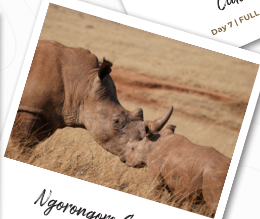
Ngorongoro Crater Day 6 | FULL BOARD MEALS