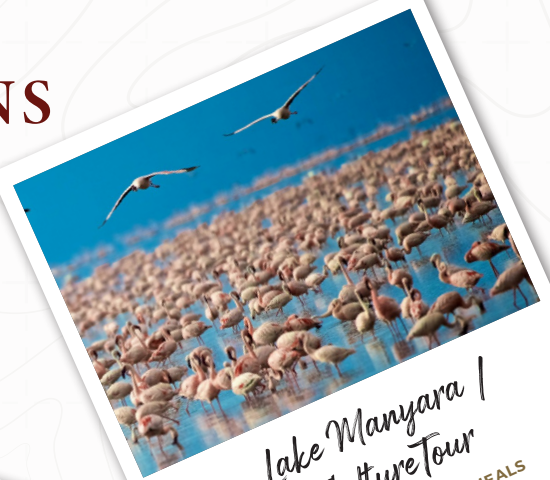
Lake Manyara / Culture Tour Day 7 | FULL BOARD MEALS